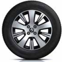
16" Adventure alloy wheel with black inserts