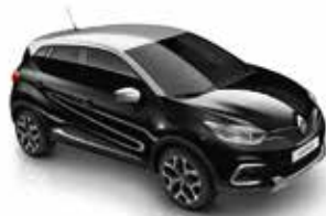
Diamond Black Mercury roof (XVT)