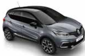
Oyster Grey Diamond Black roof (XNK)