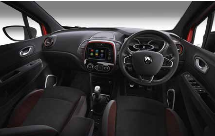
Red Interior touch pack