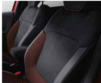
Alcantara TEP upholstery with red stitching