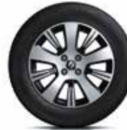
16" Adventure alloy wheel with black inserts