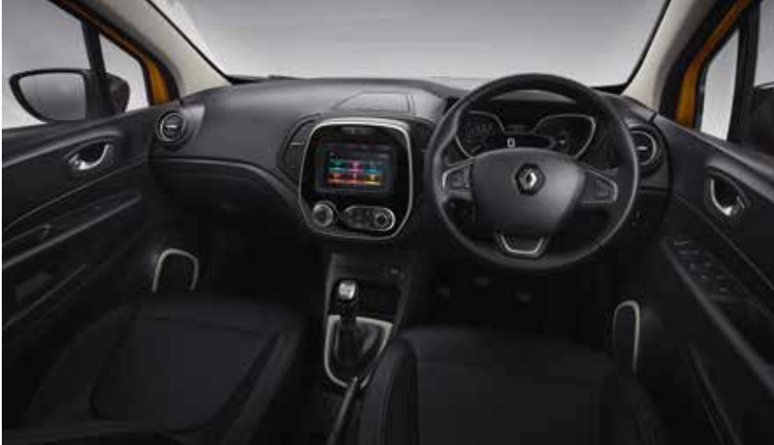
Ivory interior touch pack

Trim on centre console, speakers, air vents and gear gaiter