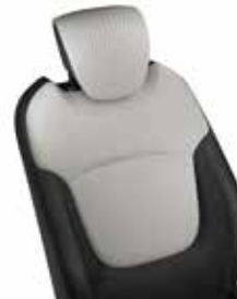
Fixed ivory upholstery