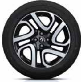
17" Explore alloy wheel with black inserts