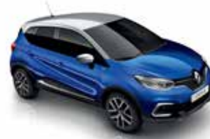
Iron Blue Mercury roof (YNN)