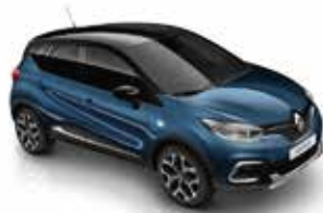
Boston Blue Diamond Black roof (XPE)