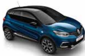
Ocean Blue Diamond Black roof (XWD)