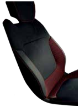
Fixed Alcantara TEP upholstery with red stitching