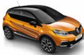
Desert Orange Diamond Black roof (XWB)