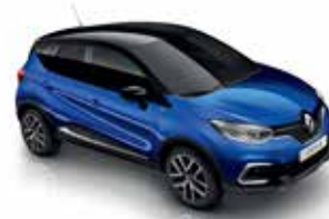
Iron Blue Diamond Black roof (YNM)