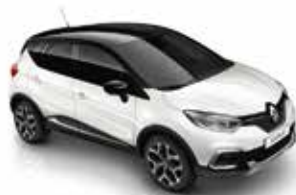
Arctic White Diamond Black roof (XUI)