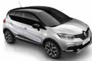
Mercury Diamond Black roof (XNM)