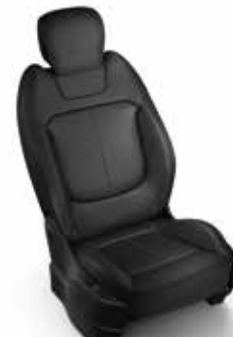
Black synthetic leather