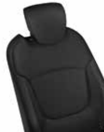
Fixed black upholstery