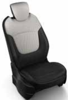
Fixed ivory upholstery