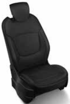
Fixed black upholstery