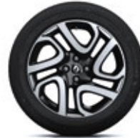
17" Explore alloy wheel with black inserts**