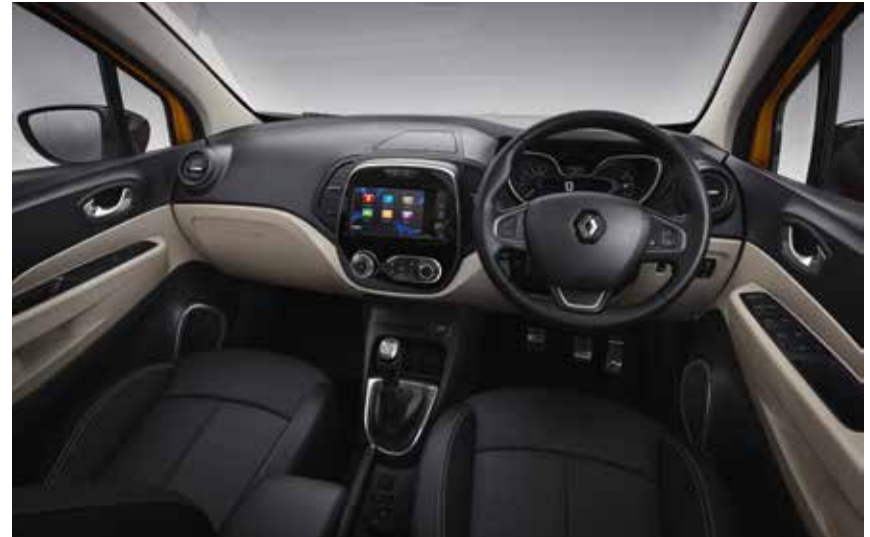
Chrome interior touch pack with light harmony

For permitted colour combinations, please speak to your dealer