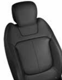
Black synthetic leather upholstery