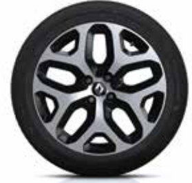
17" Emotion alloy wheels with black inserts