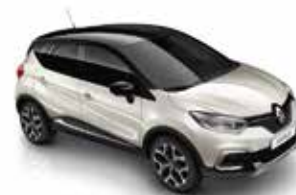
Ivory Diamond Black roof (XND)