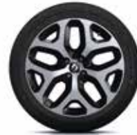
17" Emotion alloy wheel with black inserts