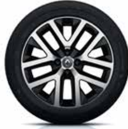
17" Filante alloy wheels with black inserts