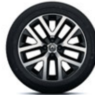
17" Filante alloy wheels with black inserts