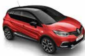
Flame Red Diamond Black roof (XPA)